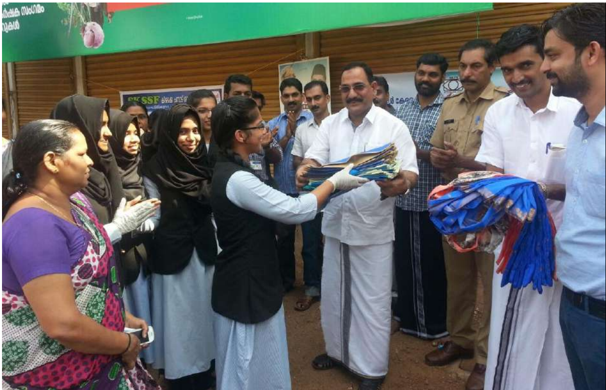
Supplying cotton bags to the panchayath.