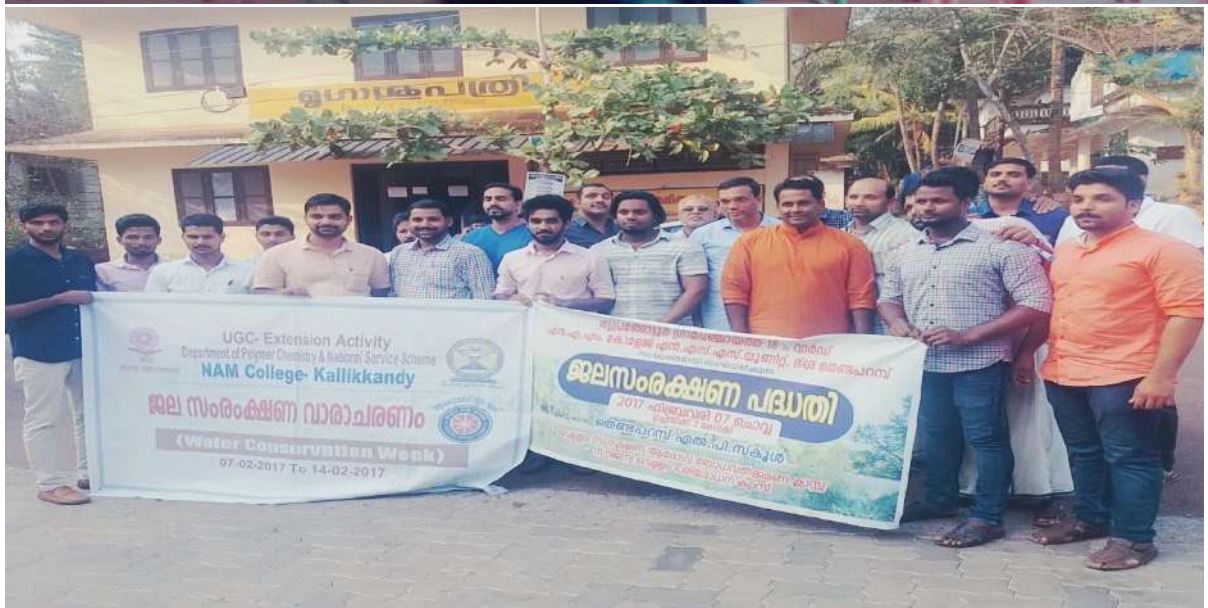
Water analysis project – inaugural function