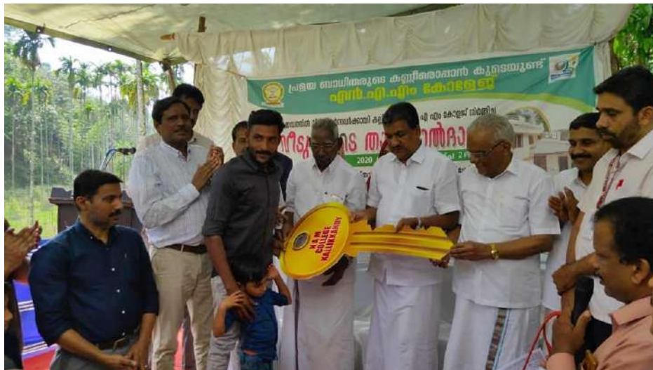
Key hand overring ceremony to the flood victim

Results :The flood relief programme has been successful in providing assistance to families affected by the 2018 floods. The programme has helped over 200 families build new homes and provided them with the necessary supplies to start their lives over.