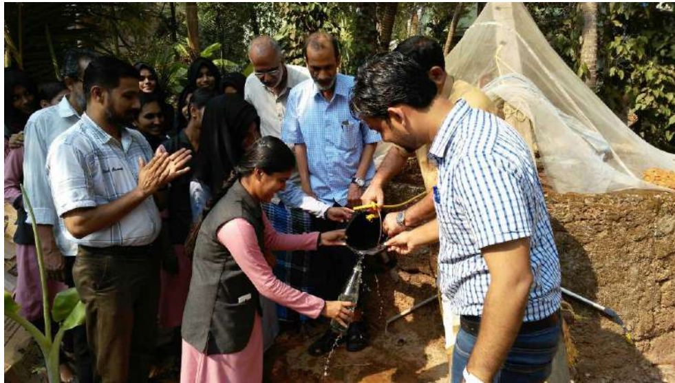
Collecting water from the panchayath tap