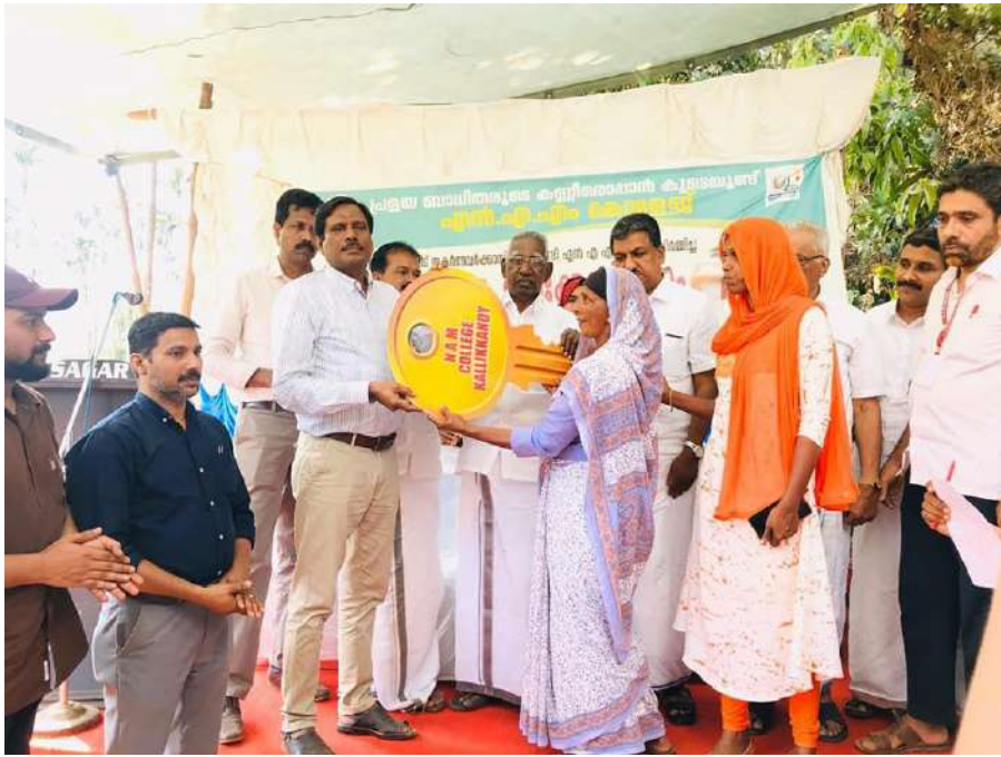
Key hand overring ceremony to the flood victim