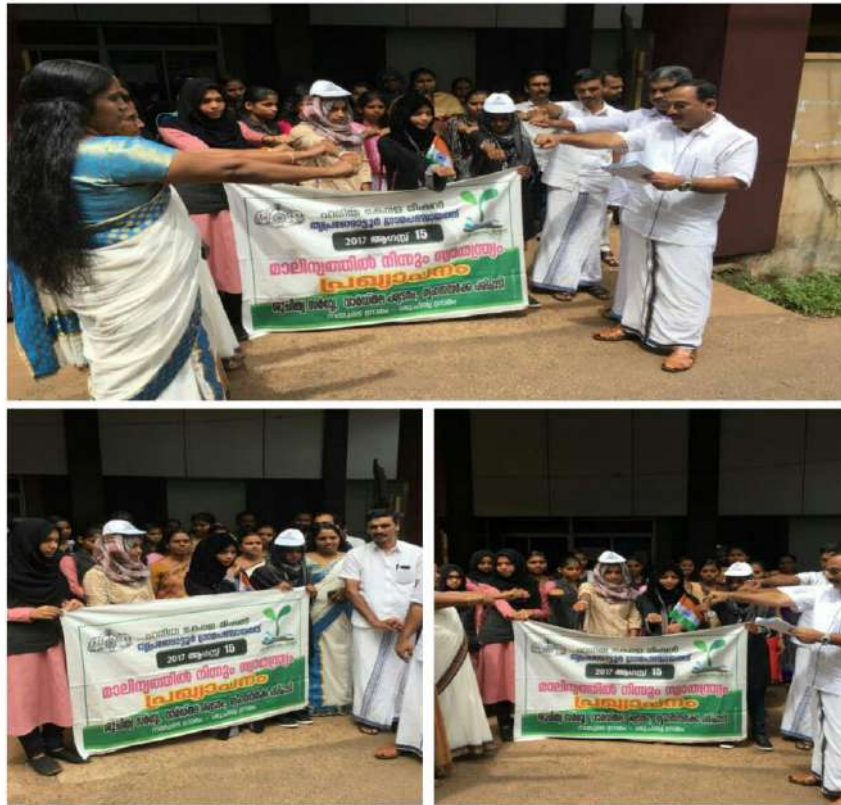
Declaration of clean town at Kallikkandy