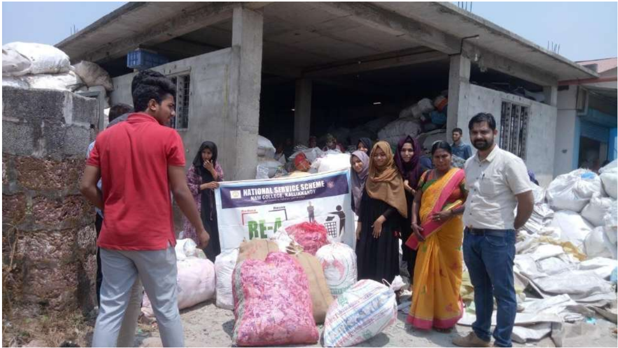
Dispatching collected to the recycling centre