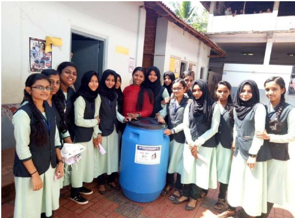
Providing plastic collection bin to various schools