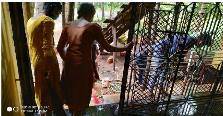
Cleaning flood effected houses