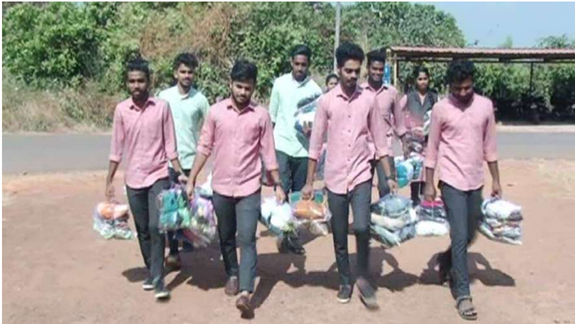
Students collecting dresses