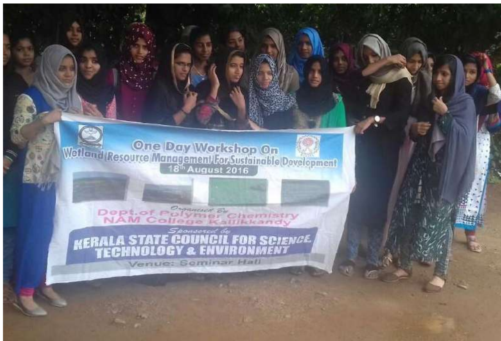
Visit to mangrooves