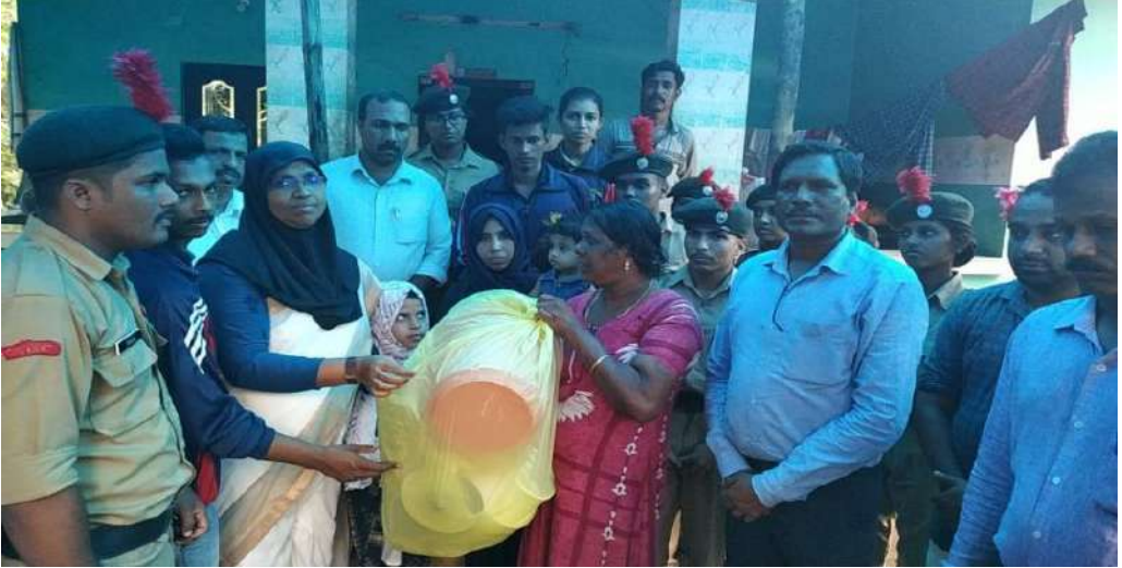
House hold distribution to Flood Victims