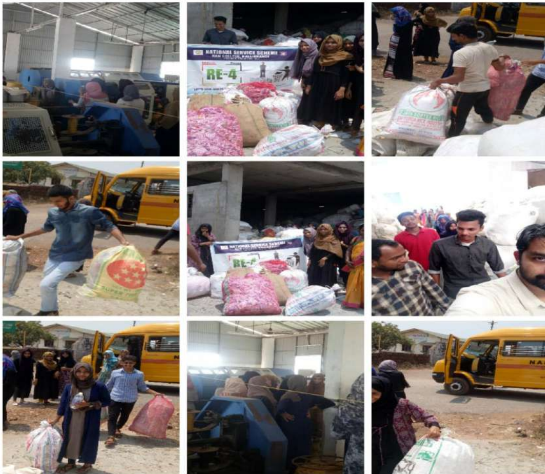
Providing dress to the flood victim