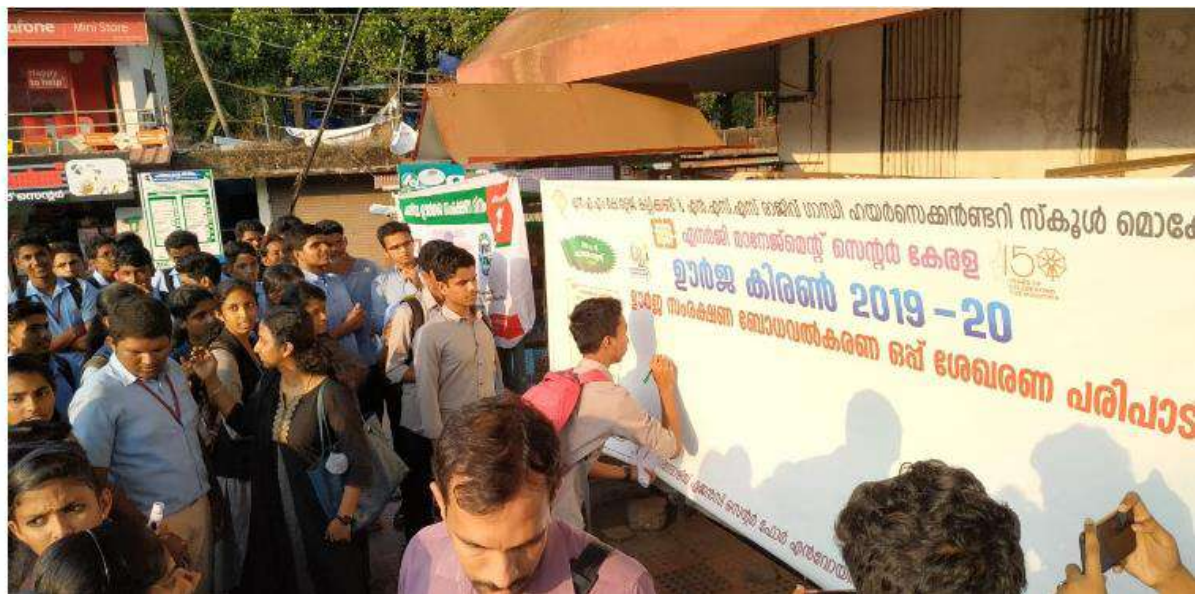
Signature campaign at Panoor