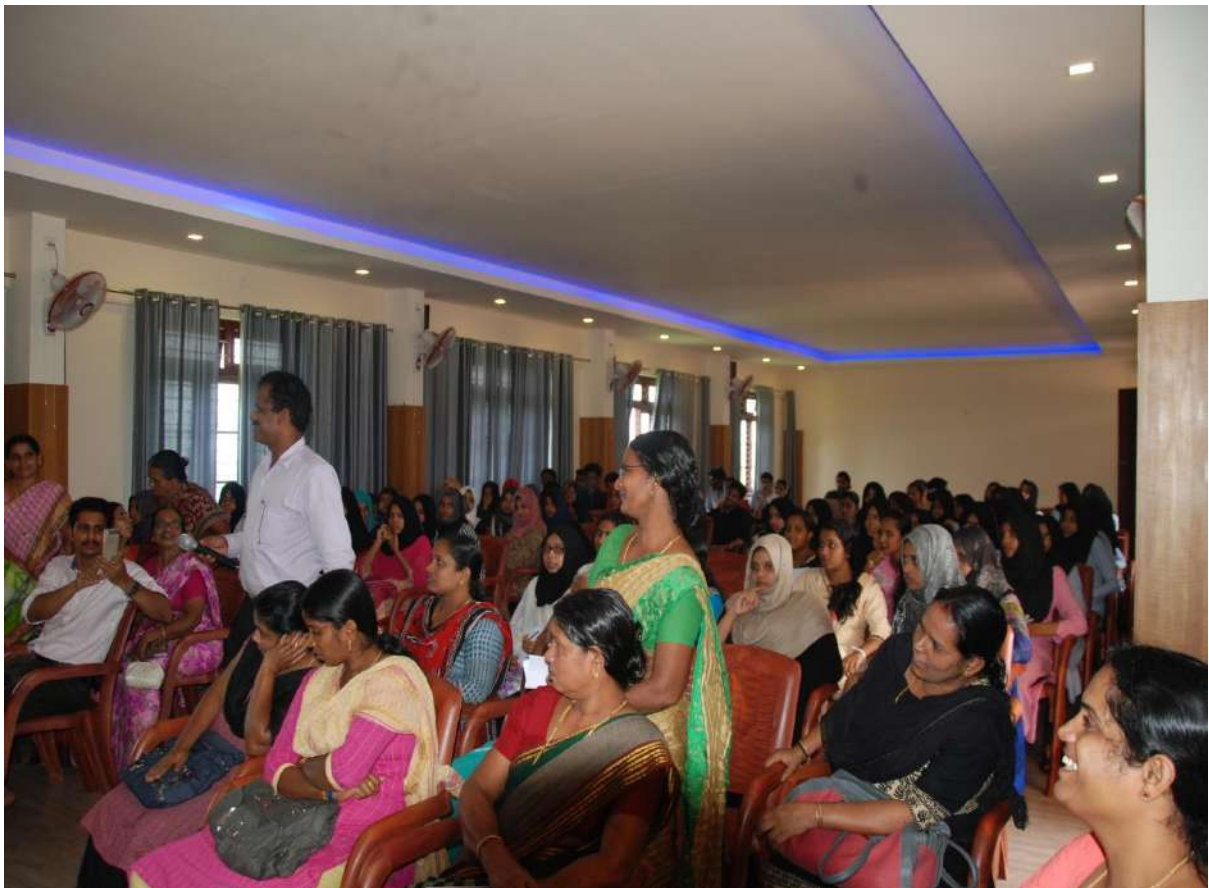
Participants in the seminar