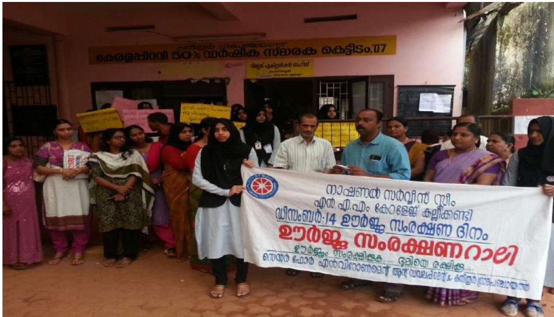
Energy Conservation Rally

if there is gradual decrease in the electricity bill by the efficient use of electrical devices. We were also very grateful by conducting such an extension activity with a relevant topic such as energy conservation.