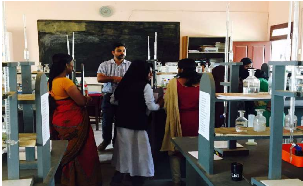
Water analysis in the department lab