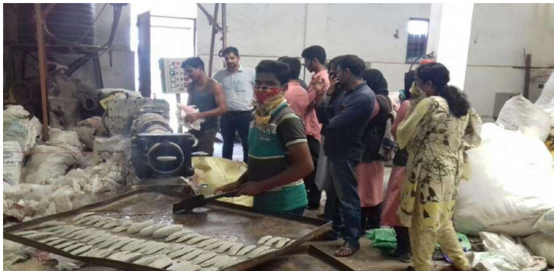
Volunteers in the plastic recycling centre