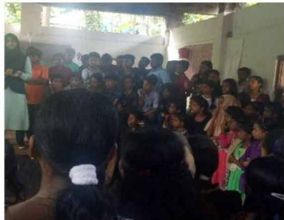
Plastic free environment activities