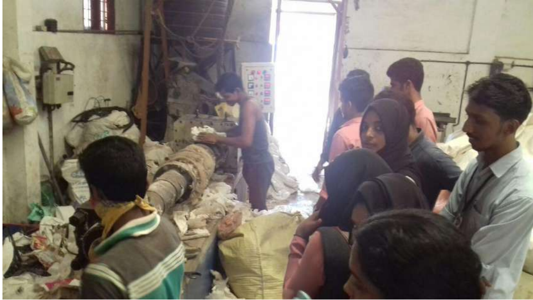
Volunteers in the plastic recycling centre

The representative of NSS units and programme officers went to the plastic recycling centre on 19 th August. The trip aims to implement Re-4 project. At the centre we saw the process of recycling the collected waste plastic bags. The recycled plastics were made in to useful things such as ropes, water tank connecting pipes etc.