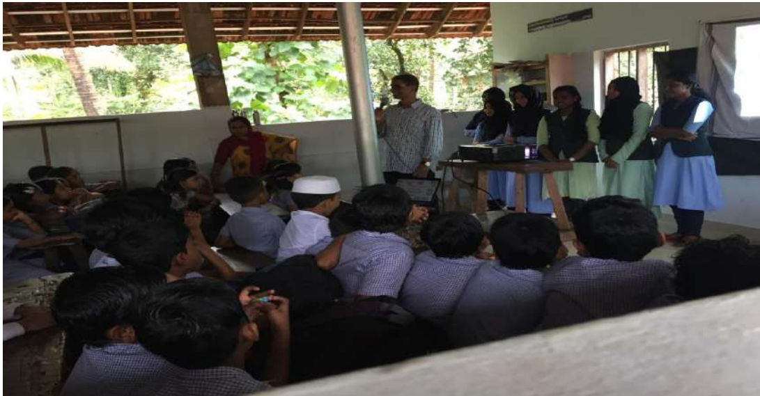
Visit to Narikkottumala tribal area.