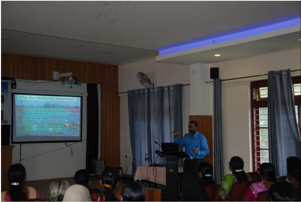
Talk by resourse person